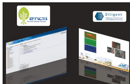
The ETICS interface and DILIGENT tools.

"The way they are using the system gave us many requirements for the testing system," explained Alberto Di Meglio, the ETICS project manager. "For example, consider the case where you want to execute a test and have the system build or deploy components on a given node before the test starts. A number of specific